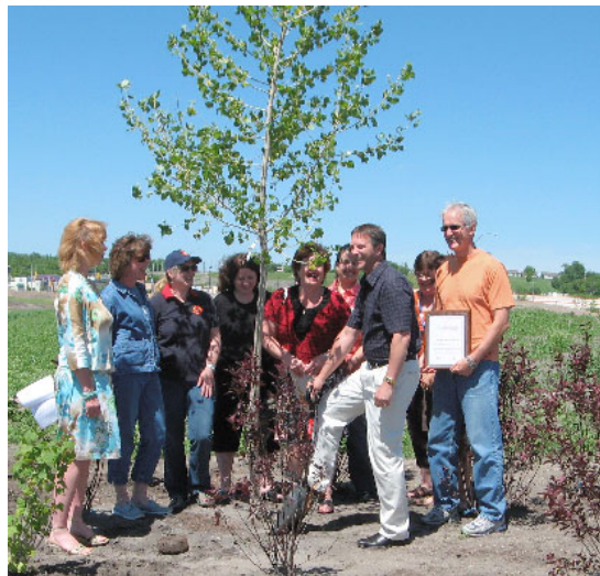
Mayor Dave Burgess plants tree with members of Brandon & Area Safe Communities

Brandon & Areas Safe Communities also launched their new logo (below), which complements the new branding of the national office.